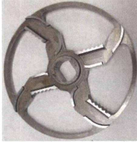
W.1.6565 Comparable with (AISI 4340) and (Alvar 14)